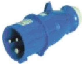
IEC60309 plug (16A 2P+E)