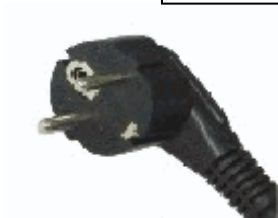
DIN49441 16A plug